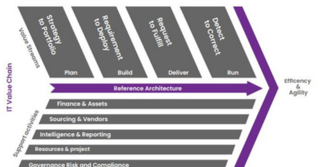
IT Value Chain